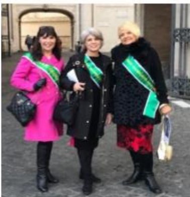
Three Amigas in Rome