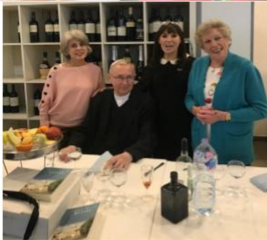
Archbishop Stanislaw Gadecki Archbishop of Poznan, Poland