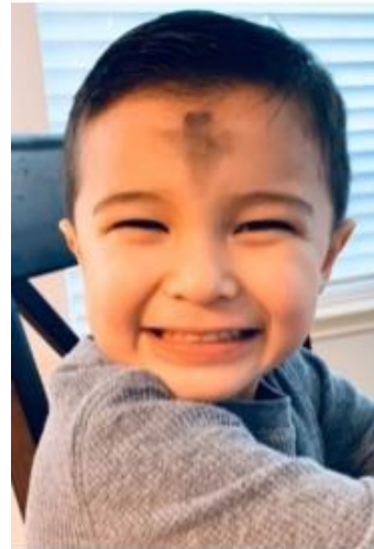
“From dust you came and to dust you shall return”.